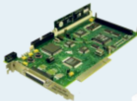
Special purpose microprocessor board